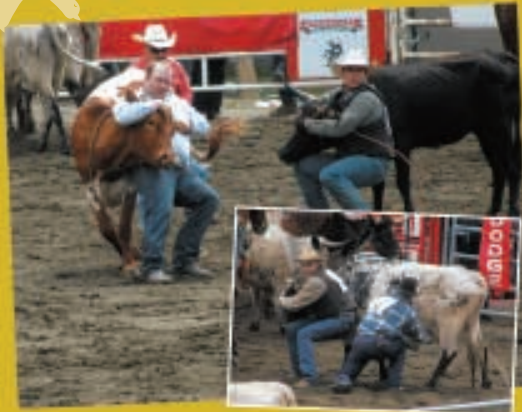
The first team to fill their cup wins.

In the Team Steer Roping event steers are chased and are lassoused by two cowboys. One lassos the head and the other the two back feet. The intent is to stop the animal by pulling in opposite directions stretching out the steer.